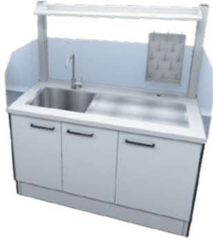
Special setup with shelving installed and fluids coming from wall or floor .

Ask for special combinations if you need a unique setup