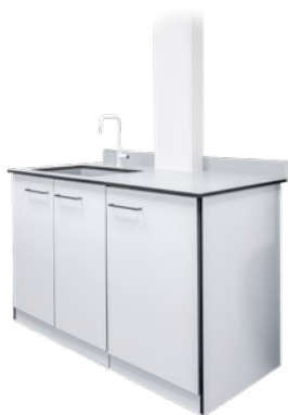
Clean setup for concealed fluid hosing coming from ceiling .