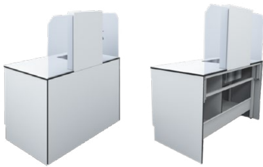
Same setup for island (covered back) or wall (naked back). Visible fluid hosing coming from the top.